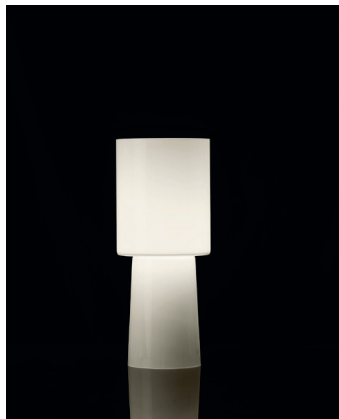
Table lamp 36

Table lamp made out of two geometrical elements in white shiny opal glass; the cylinder and the cone. By the placement of the light source, the light is visible in both shade and foot. The light from the cylinder also goes downwards through the cone. Olle 36 is made in one piece of glass. Black details, white flex with switch.