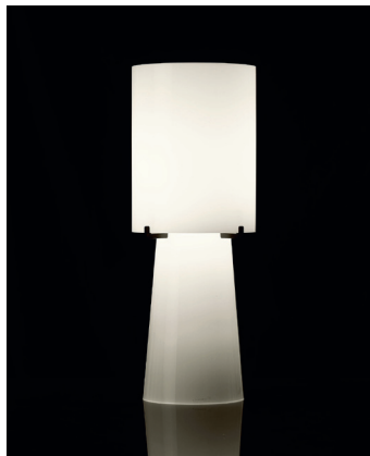
Table lamp 50